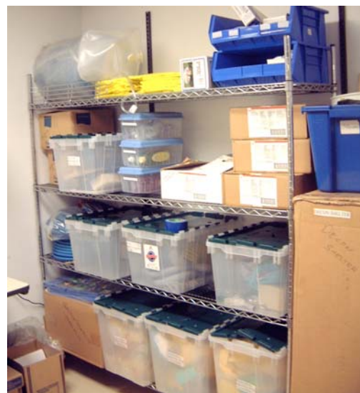
A storage room near the ED door offers convenient access for first receivers' supplies.