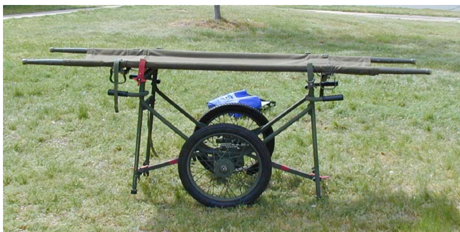
Hospitals can obtain military surplus equipment to supplement the decontamination facility supplies. (Shown here: a field stretcher for transferring non-ambulatory victims from arriving vehicles to the decontamination facility.)