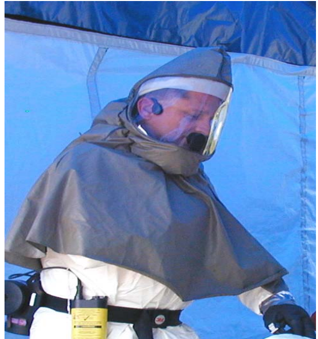
“Temple-transducer” style two-way radio headset stays in place under PAPR hoods.