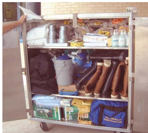
Staff can quickly move wheeled equipment carts from storage to the staging area.

Long-term maintenance of battery-powered respirators, such as PAPRs, creates a special challenge. The