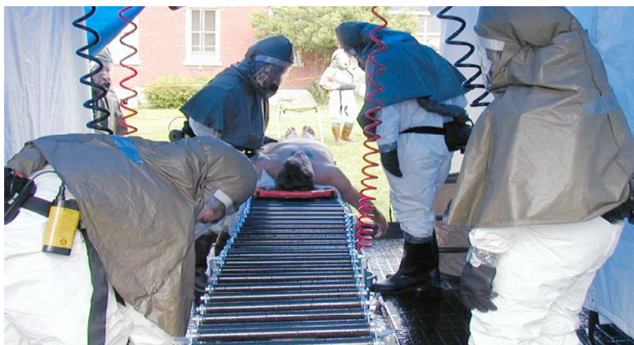
A roller system platform helps move non-ambulatory victims on backboards through the decontamination facility.

Because of the time it takes first receivers to put on PPE and to set up decontamination facilities, hospitals may want to consider arranging for alternate rapid forms of decontamination until more sophisticated decontamination facilities are up and running. For example, some hospitals use high capacity, low-pressure hoses or showerheads, connected to high capacity, temperature-controlled water sources. These hoses and showers allow rapid preliminary drenching of multiple victims. Where multiple shower heads can be activated, ensure that the available water flow into, and through, the system is adequate to provide rapid decontamination at each shower head. 68