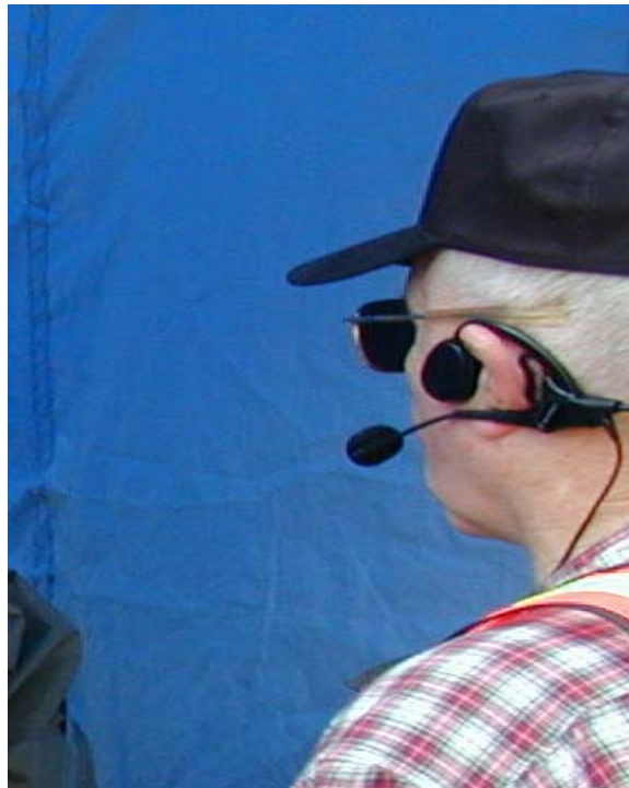
Detail of “temple-transducer” style radio headset.