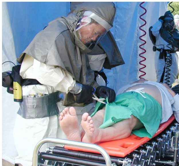
Use blunt scissors to cut away clothing. Avoid stretching or wringing cloth.

Non-ambulatory victims can require a substantial proportion of first receivers time and efforts. First receivers are likely to experience the greatest exposures while assisting these victims. Staff should take steps to identify possible sources of contamination and limit their exposure to those sources. For example, Hospital A uses specific procedures for removing victims clothing to minimize first receiver and victim exposures. Assistants use blunt-nose scissors to cut away clothing, rather than pulling it off. Tugging on clothing can produce a wringing action that might distribute contaminant on the victim, healthcare workers, and the surrounding area. Once removed, the clothing is immediately placed into a sealed container.